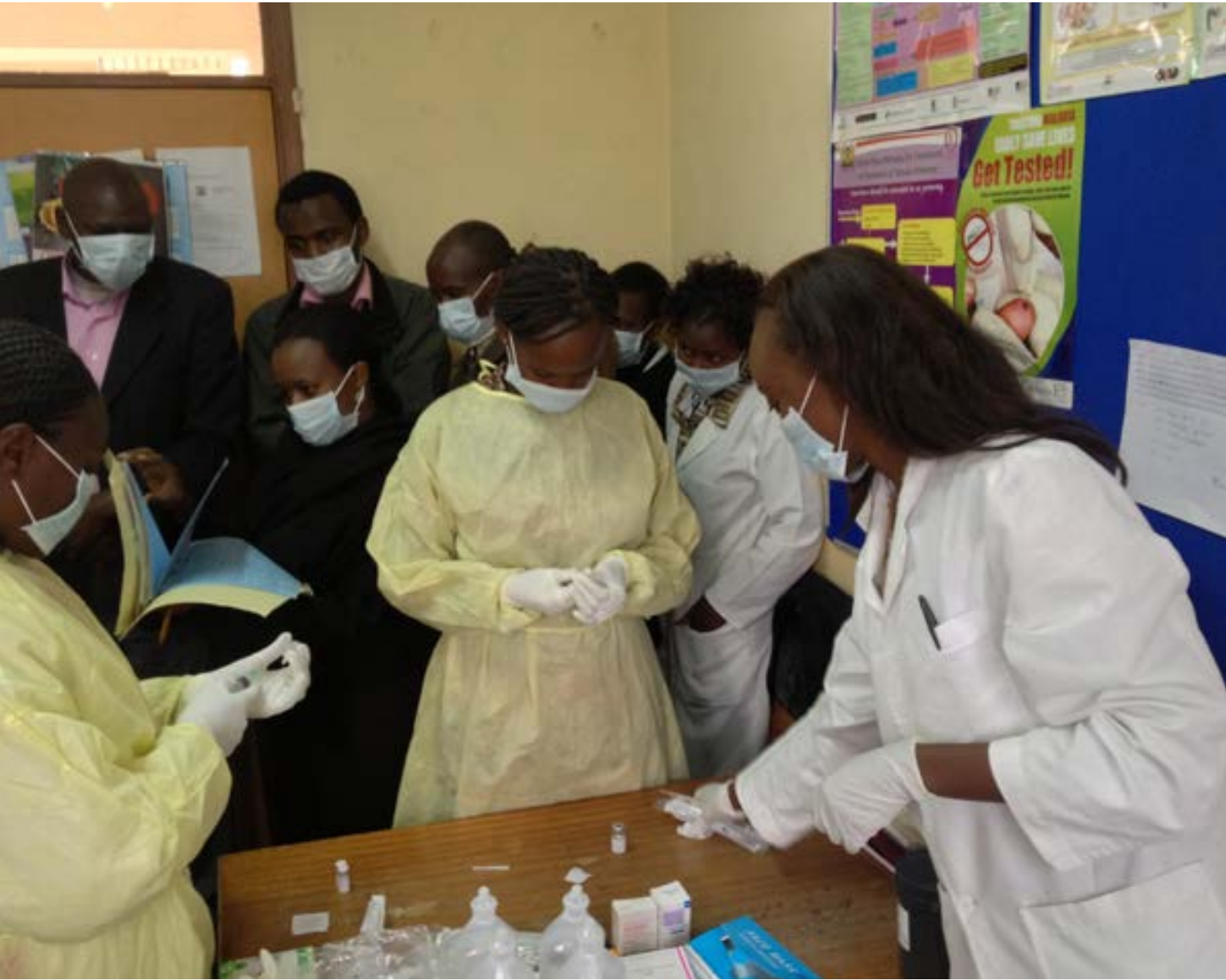
Kaposi's sarcoma treatment training session at Engineer District Hospital