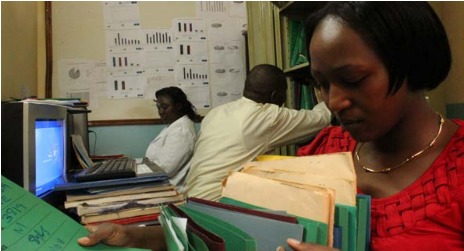
Data clerks at Murang'a District Hospital's Comprehensive Care Centre