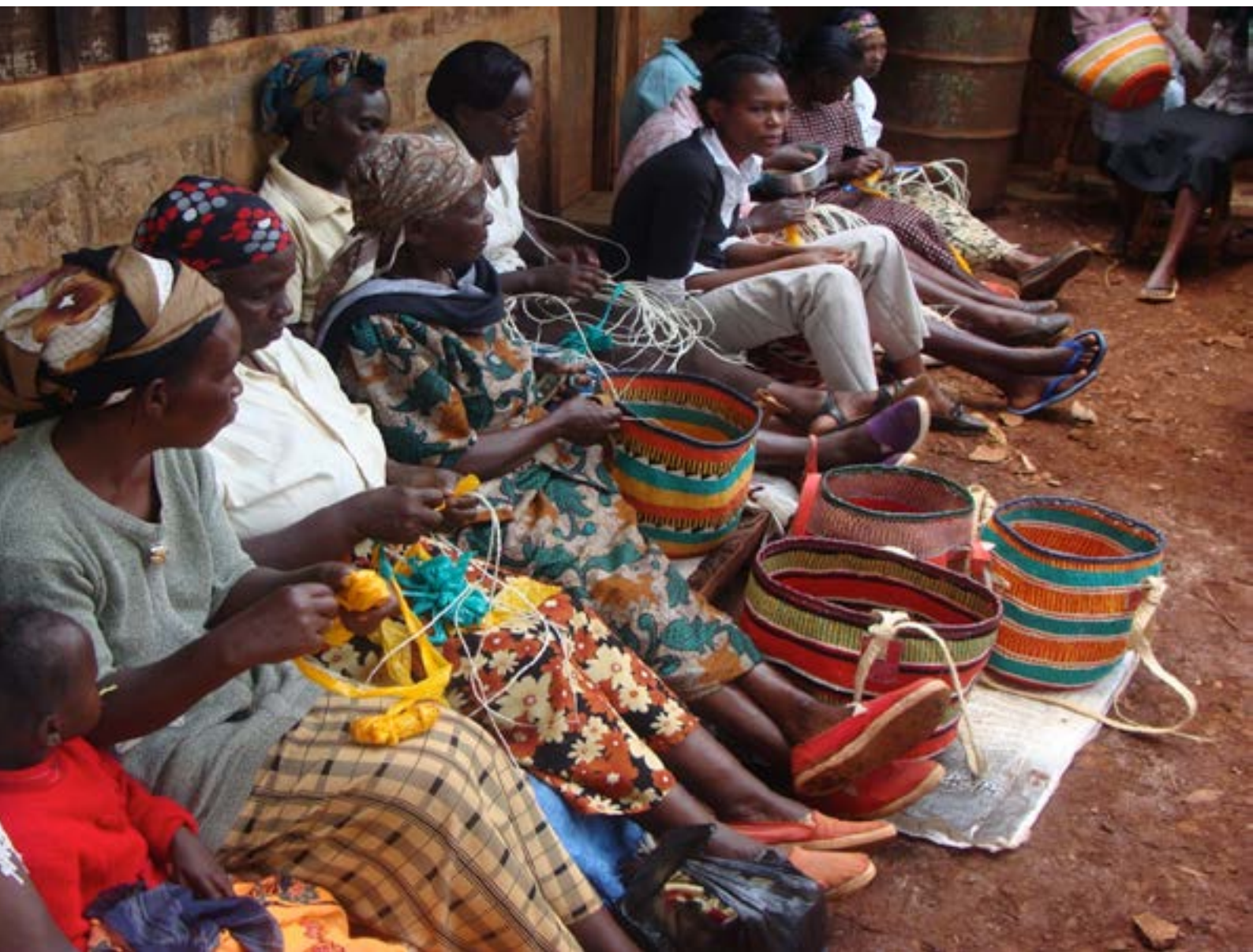
Members of a Vision Garden support group engage in basket making as an income generating activity