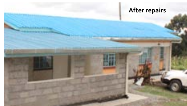
Repairs at Engineer District Hospital