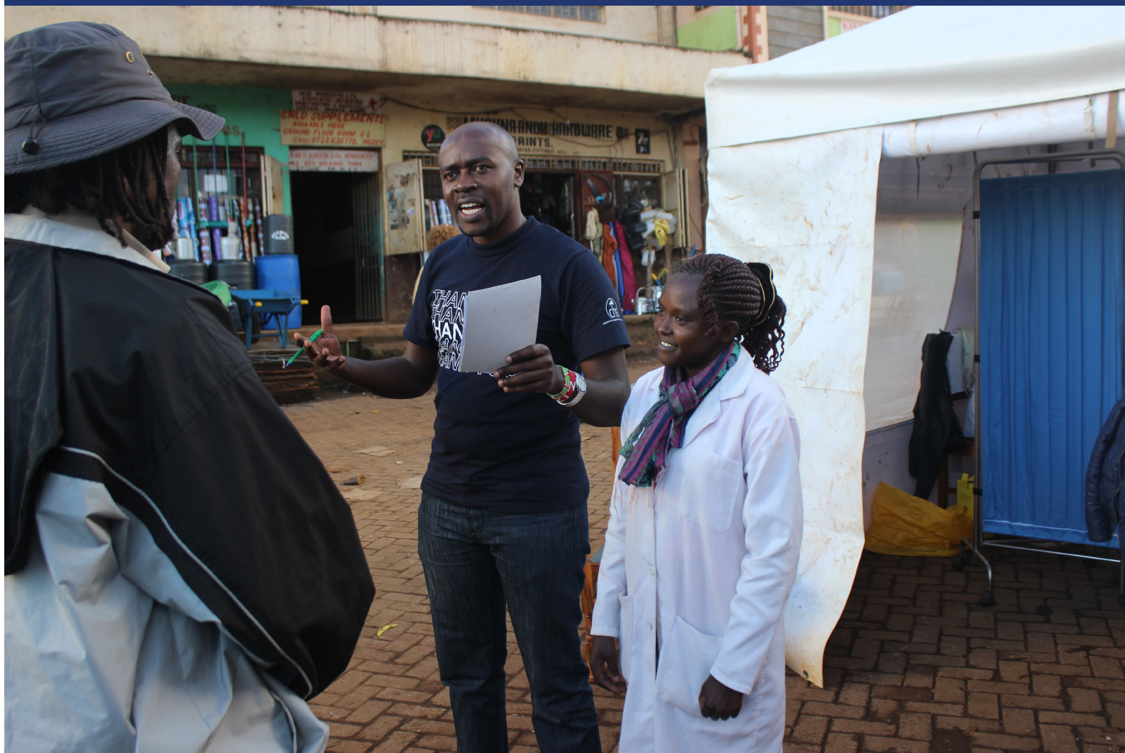
CHS supported HTS Counsellors from Kangari Health Centre giving a health talk while mobilizing community members for testing during a targeted community testing activity in Murang'a County