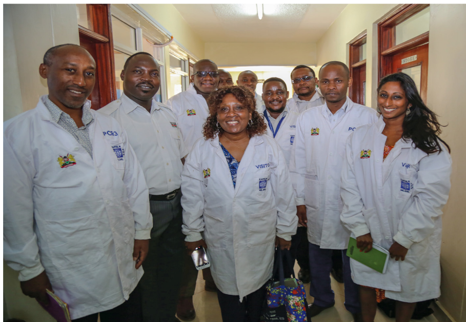
Team from CDC Atlanta, Zambia, Zimbabwe, Uganda, Tanzania and Kenya visiting Machakos Level 5 Hospital for a benchmarking activity on the use of TB Preventive Therapy

CDC through CHS strengthens human resource capacity by supporting facilities with different cadres of health care workers including: Clinical Officers, Data Clerks, HIV Testing Officers, Nurses, Nutritionists, Adherence Counsellors, Accountants, Laboratory Technicians among others to bridge the human resource gap.